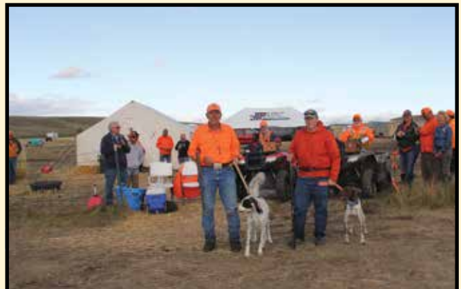
Final hour start