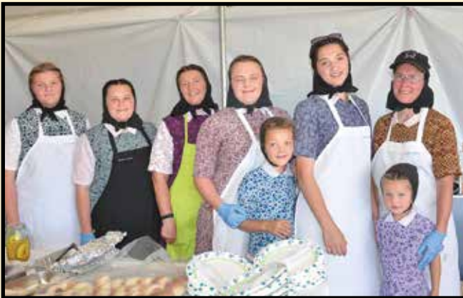
Hutterites' Women who made everything so special