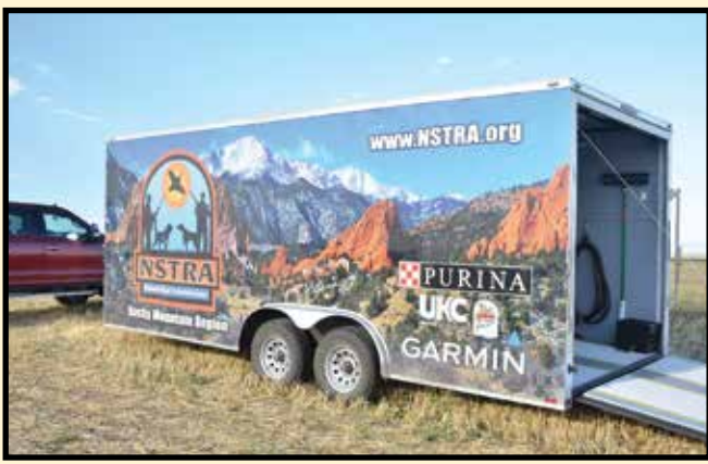
Advertisement for NSTRA from the Rocky Mountain Region