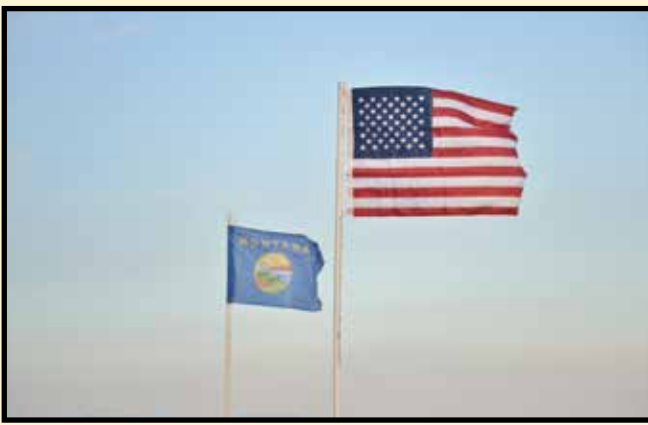
United States and Montana Flags