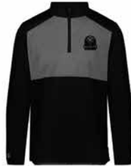
Series X Quarter Zip Pullover $54.50 - $57.50