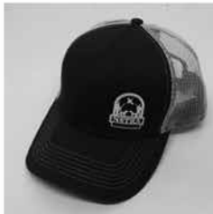
NSTRA Safety Yellow LFP Hat $18.00