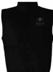
Black Fleece Vest $30.00 - $36.00