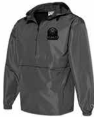
Graphite Champion Rain Coat $39.50 - $43.50 Low stock