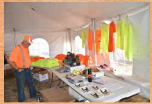
Davy Caven looking over BSR merchandise