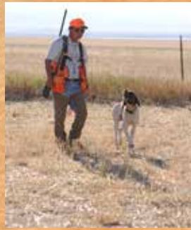
Dale Ikuta – a photographer