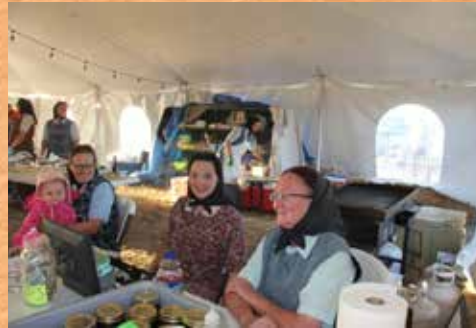
King Colony our hosts