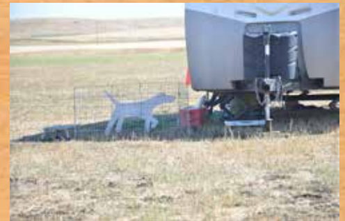
Bet this dog doesn't bark