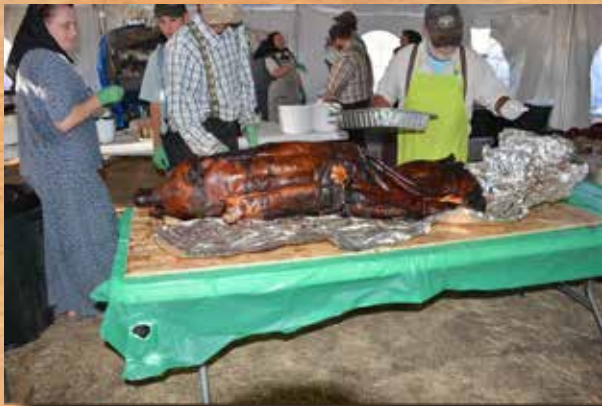
The PIG in all its glory – BEFORE