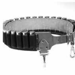
Leather Shell Belt $100.00