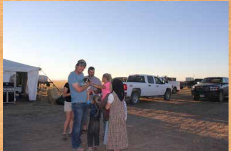
You will always get a crowd when a puppy is involved