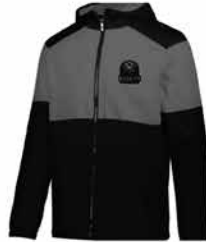
Series X Jacket $57.50 - $60.50 Low stock