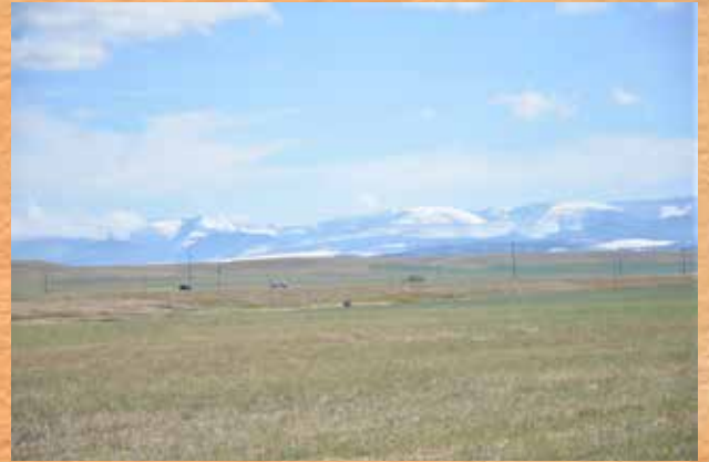
More Big Sky