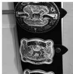
Trophy Buckle Hanger $50.00 - $60.00