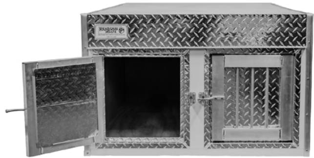
Flat Top/No Storage