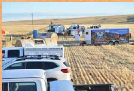
Rocky Mountain NSTRA Trailer