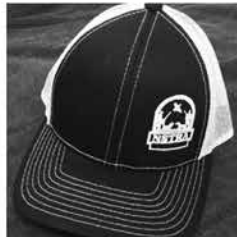
NSTRA LFP Hat blk/yellow $18.00