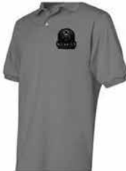
Safety Orange Polo $25.00 - $30.00