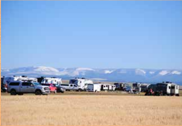
Big Sky Scenery