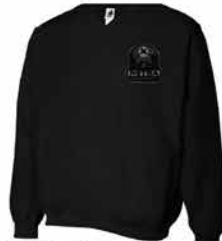
Black Wind Shirt $39.50 - $43.50