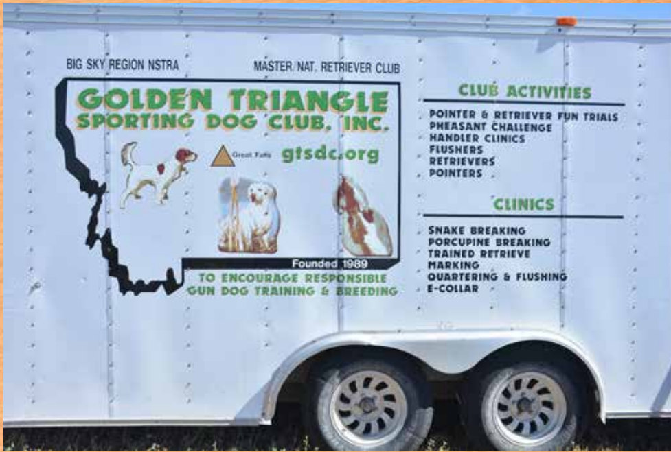
Big Sky NSTRA Trailer