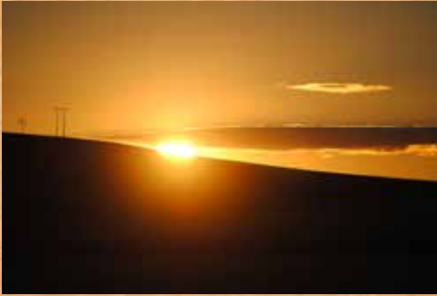
Sunrise in Lewistown Montana