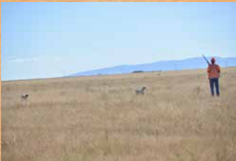
Link pointing and Clyde backing