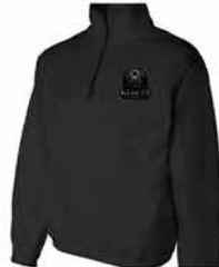
Charcoal 1/4 Zip Fleece Pullover $36.50 - $42.50