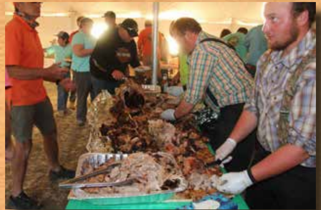
The PIG - AFTER

On Saturday, the trial started at first light as the contestants prepared for a marathon.