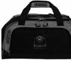
Breakaway Duffel $49.00