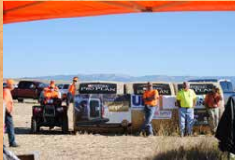
Motley crew watching the action