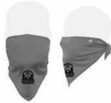
Safety Orange Face Guard $10.00 - $65.00