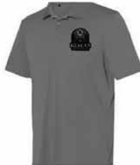
Orange Adidas Dri-fit Polo $44.00 - $48.00