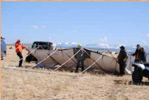
Men at work building a tent