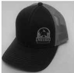
NSTRA left front panel logoed hat $18.00