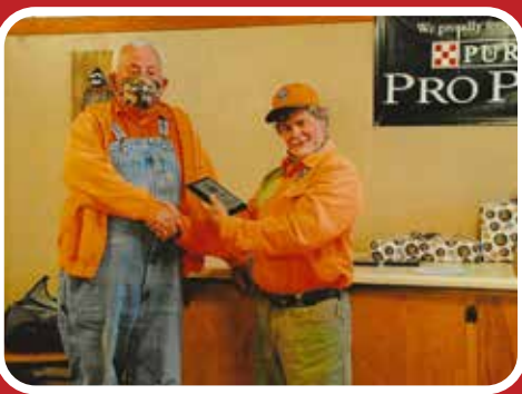
Sportsman of the Year