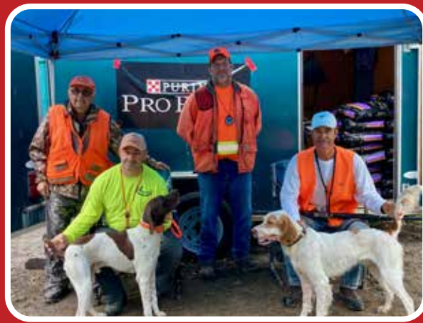
Top 2 with our Judges