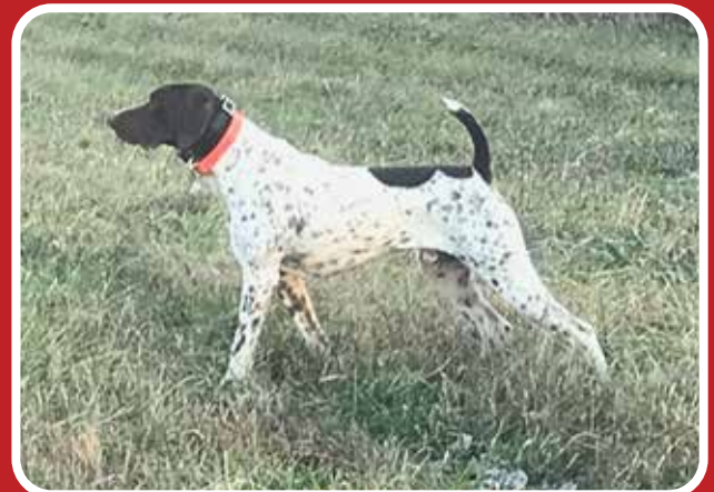
Double Nickels (Deuce) 2021 Dixie Region Champion