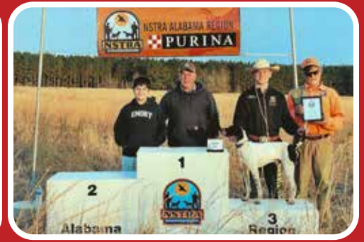
Second Runner Up