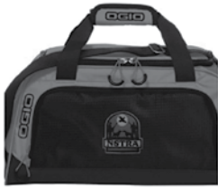
Breakaway Duffel $49.00