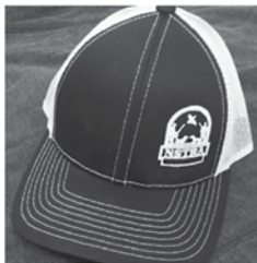
NSTRA LFP Hat blk/yellow $18.00