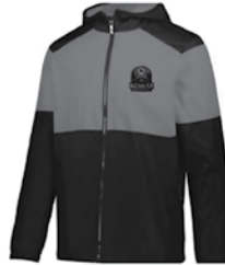
Series X Jacket $57.50 - $60.50 Low stock