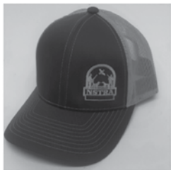
NSTRA left front panel logoed hat $18.00