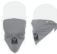
Safety Orange Face Guard $10.00 - $65.00