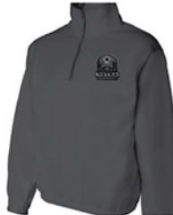
Charcoal 1/4 Zip Fleece Pullover $36.50 - $42.50