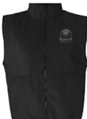
Black Fleece Vest $30.00 - $36.00