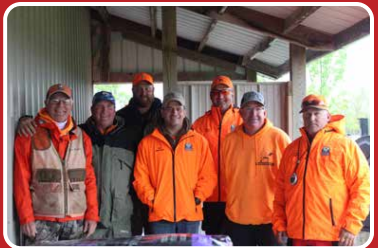
MW 2021 REGIONAL OFFICIALS- Left to Right