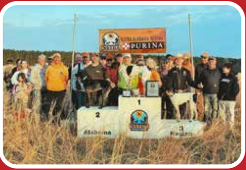
Our regional family