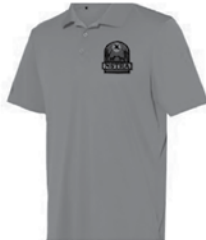
Orange Adidas Dri-fit Polo $44.00 - $48.00