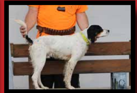
Billy Owned/handled by Gary Rhein's Ohio Region