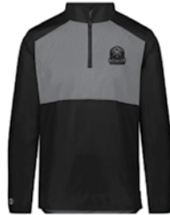
Series X Quarter Zip Pullover $54.50 - $57.50