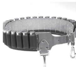
Leather Shell Belt $100.00