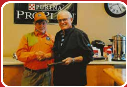
Judge of the Year