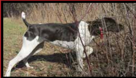
Hi Points Hill Song "Tessa" Wisconsin