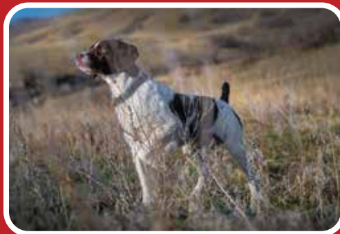
1X NSTRA Champion – Just Call Me Boone’s Shadow 2020-2021 Region High Point Dog