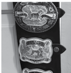
Trophy Buckle Hanger $50.00 - $60.00