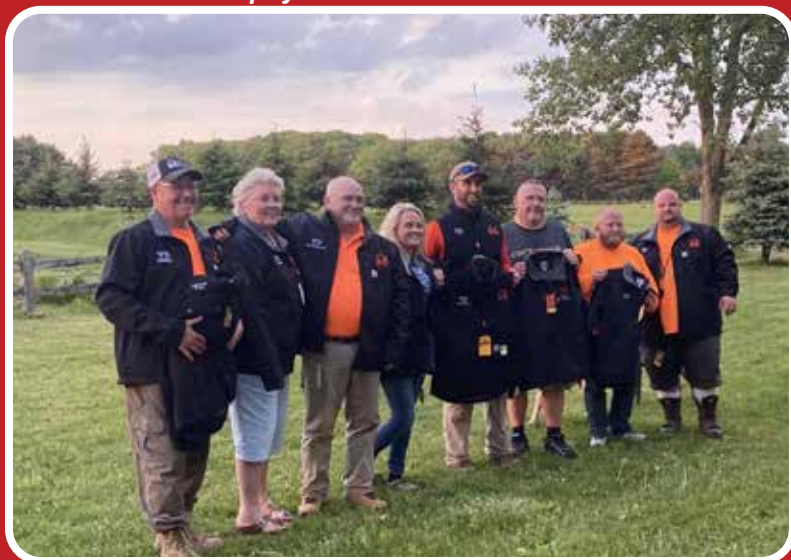
Open Highpoint Top Ten Handlers