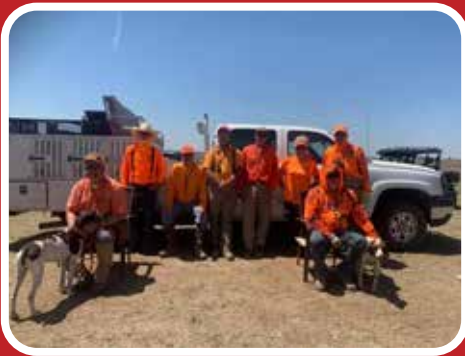
The final 6

I would like to thank everyone for a great weekend. We had a great trial and banquet. This would not have happened without the help of a lot of people. West Texas is blessed to have an amazing region with even better people.