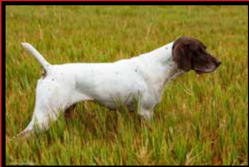
Sterndog's Kookkas Nikki High Point Winner Florida Region