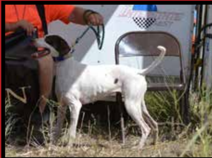
Uno Owned & handled by Ed Westbrook Northwest Region