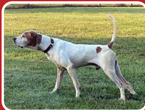
2021 ECR Regional Champion: Taylor's Foolish Boy