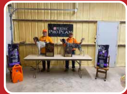
The final 2