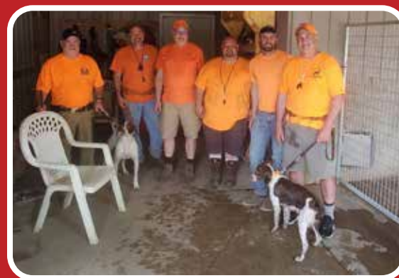
The Top 6 Handlers waiting in the Blind.