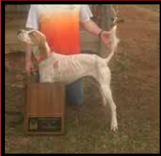
Tricky Dick Oak Bo Timothy String Mid South Regional