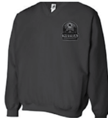
Black Wind Shirt $39.50 - $43.50