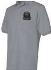
Safety Orange Polo $25.00 - $30.00