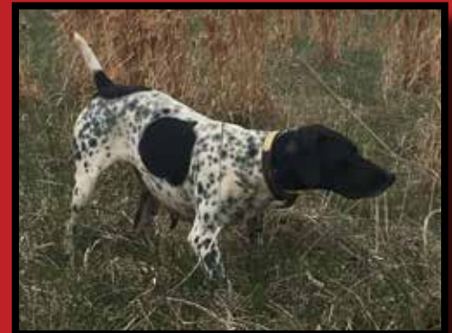
Rocking G's Mary Ann High Point Winner Oklahoma