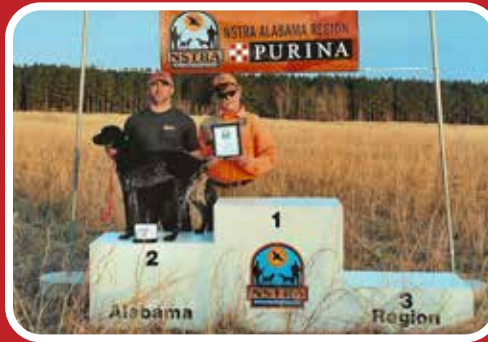
First Runner Up