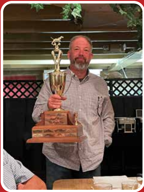
Jody High Point Dog