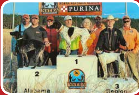
Judges and first 3 placements