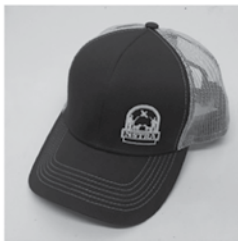
NSTRA Safety Yellow LFP Hat $18.00