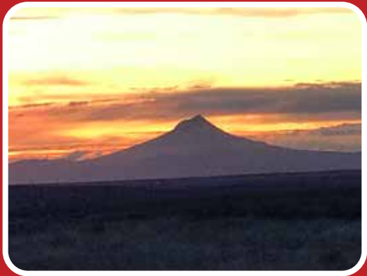
This is the backdrop at sunset for the NW Regional Elimination Trial - Buckhorn Ranch near Condon OR.

Members of the NW NSTRA region convened on the second weekend in June at the Buckhorn Ranch, Condon, Oregon. The region trial was drawn with 30 qualified dogs and 14 handlers. Due to unforeseen circumstances a bye-dog/hander was replaced for a handler that was unable to participate in the competition.