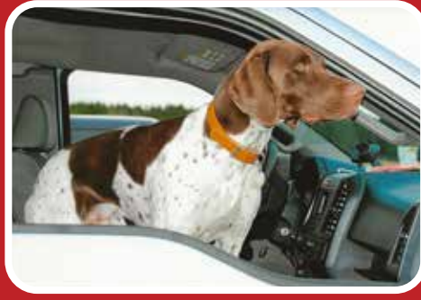
Cooper trying to watch the bird planter