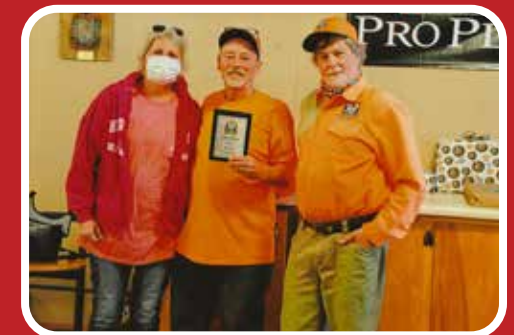
Rookie of the Year