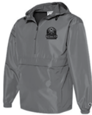
Graphite Champion Rain Coat $39.50 - $43.50 Low stock