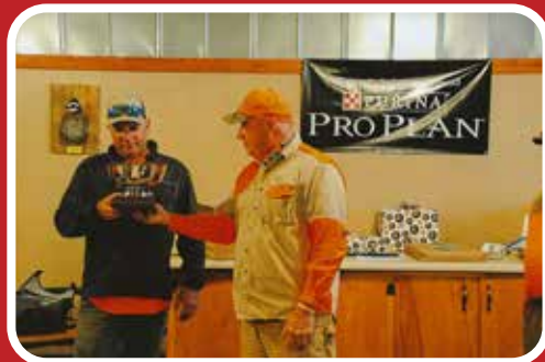
High Point Dog