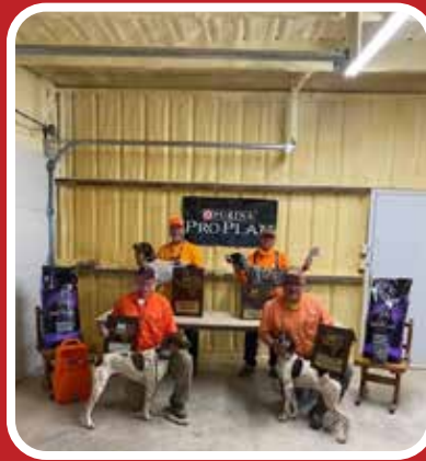
The final 4